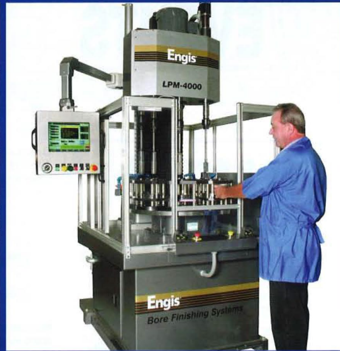
Machine utilizing single-pass bore process with diamond tooling.

products increased, so did need for sophistication of the production processes, and the firm has been awarded not only the ISO 9001 certificate for quality but ISO 14001 for a clean and safe working environment. High precision gears are essential to effective power transmission, lower noise, and the bike's overall performance. The firm's engineering staff presented a challenge to the plant's manufacturing team to achieve greater precision on the gear's bore. The application called for removing 0.050 mm of material from a 20mm diameter gear which was made of steel hardened to 58-64 HRc. The tolerance on the bore called for 0.015mm and the cylindricity needed to be held to 0.008mm with a finish requirement of 0.8Ra. The plant's engineers had first considered attempting to achieve this with conventional honing equipment, which utilizes abrasive stones which expand and contract with each cycle. But they fell short of their quality and cost objectives, which prompted them to begin to look at offshore options. They then contacted a US superabrasive supplier who was able to design a single pass honing system utilizing electroplated diamond tools. The supplier was able to significantly improve upon the results previously achieved with conventional honing. Bore tolerances of 0.007mm, cylindricities of 0.005mm, and finishes of