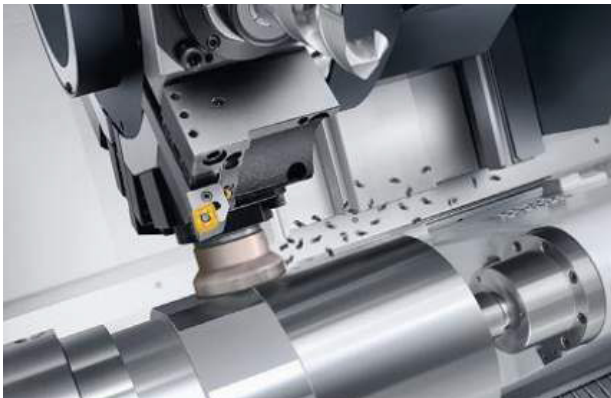
Use on any system with high pressure coolant and 10,000+ RPM

Coolant filters in CNC machines are typically built to capture large size chips produced during a regular machining process as compared to a grinding process. By simply having a filter which can capture up to 10 \mu , chips and broken grit powder can be captured.